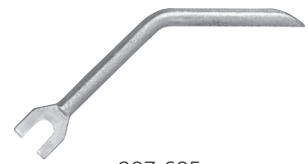
307-625 Patent # 6,460,432